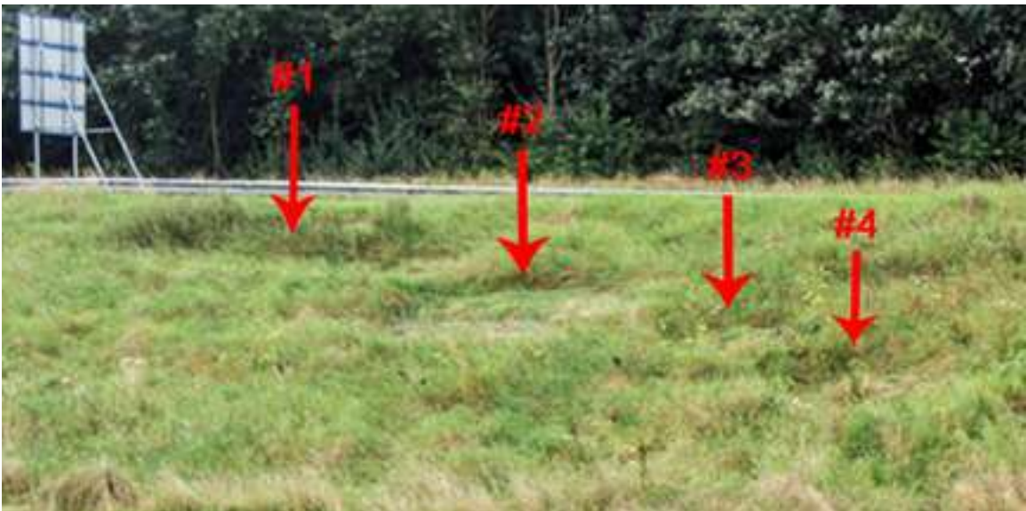
Four circles formed by 4 BOLs shooting light-beams down to ground only meters away, as Robbert pushed his bike along edge of highway.

As Robbert walked closer to the edge of the road he saw 4 circles flattened in a line along the side of the slope, overgrown with wild grasses and nettles (which have very sharp spines that sting if touched). He walked carefully down to the circles to feel the energy (which he says was very “gentle”) and, when he got to the last circle, was “flabbergasted” as an “electric” discharge of some kind--a bright flash of light--occurred right between his feet. In spite of his sense that this discharge was electrical, he did not FEEL a shock of any kind.