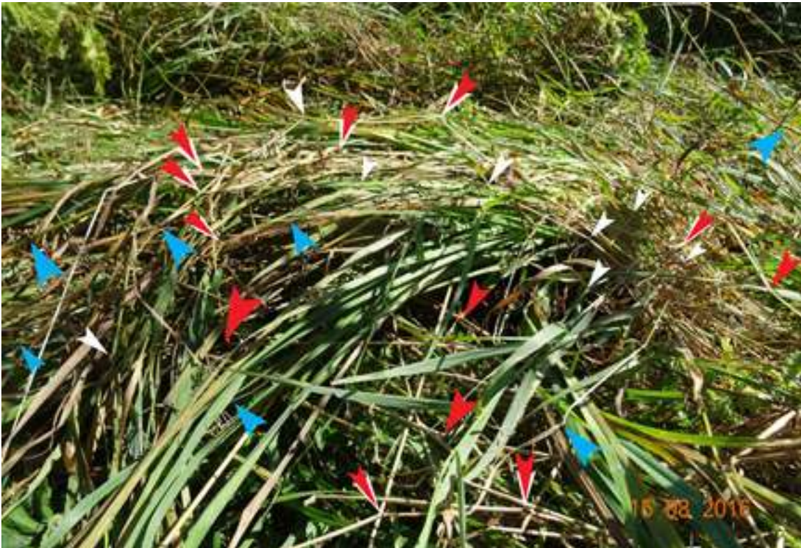
Red arrows indicate elongated nodes ; blue arrows point to expulsion cavities (holes blown out at the stem nodes); white arrows indicate downward bending nodes .

In ALL of these circles which included wild grains of varieties examined by BLT in hundreds of genuine crop circles from multiple countries over the years, clear elongated nodes and expulsion cavities --the two scientifically-documented VISIBLE plant changes known to be caused by the not-fully-understood circle-making energy complex ( http://www.blresearch.com/plantab.php ) in BLT's published papers ( http://www.blresearch.com/published.php ) were present-- as well as downward-bending plant stem nodes (rather than upwardly bent, the natural attempt of plants to reorient to sunlight, called "phototropism"). The presence of thick-stemmed weeds bent in circular swirls, without breakage, is another clear indication that these "messy" circles—created by "laser-like" light beams emanating from visible light-balls—were in fact the real McCoy.