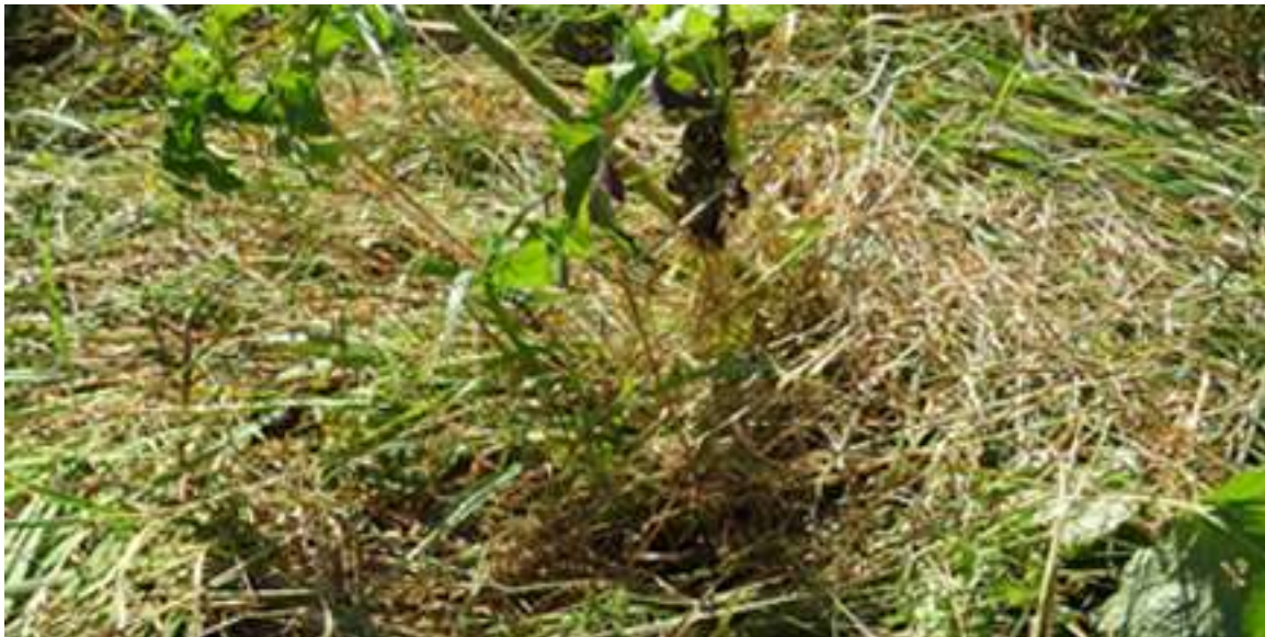
Circle #4 (smaller than #1 & #2) was swirled around a single standing nettle in amongst multiple wild grasses & weeds.