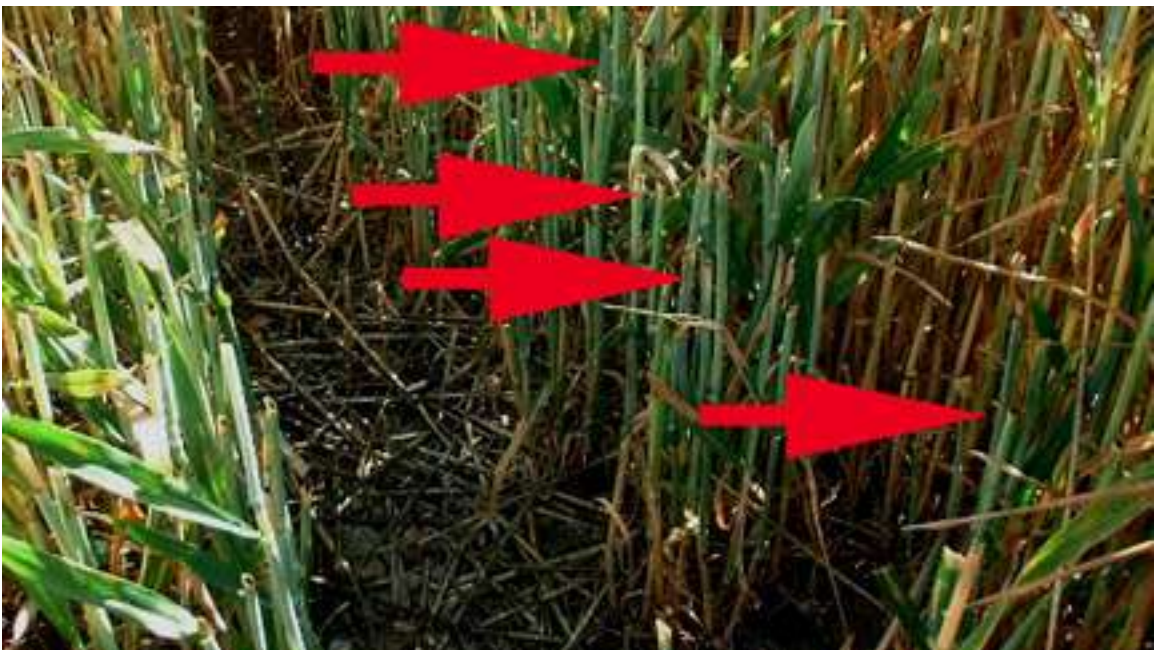
Multiple cuts and broken stems around perimeter of crop formation inside a standing section of plants inside a crop circle.

BLT's peer-reviewed and published ( http://www.blresearch.com/published.php ) findings consistently emphasize the fact that overall "geometric" design and tightly-flattened, symmetrical lays within precise perimeters are not proven indicators of authenticity . W.C. Levensgood's 1994 crop circle paper featured a decidedly "un-geometric" U.S. formation in which the plant abnormalities proved it was genuine, and the most thoroughly scientifically-evaluated formation to-date known to be real—the 1999 Edmonton, B.C., Canada formation subjected to both Levensgood's standard plant and soil tests as well as to x-ray diffraction of clay minerals in its soils ( http://www.blresearch.com/xrd.php ) by additional scientific experts in the XRD technique and in clay mineralogy--had a totally "chaotic" lay.