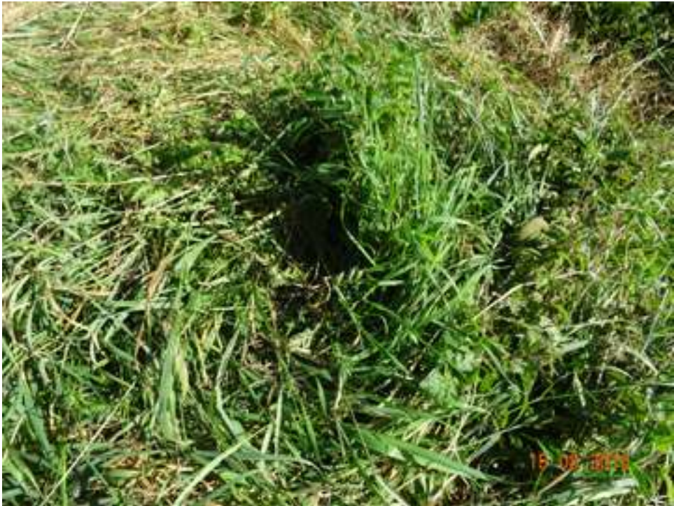
Grasses swirled around one of the apparently untouched green clumps in Circle #2.