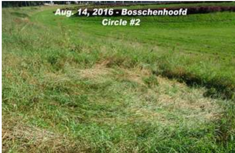
2 nd circle occurred mostly in grasses & was slightly farther down slope along edge of road.