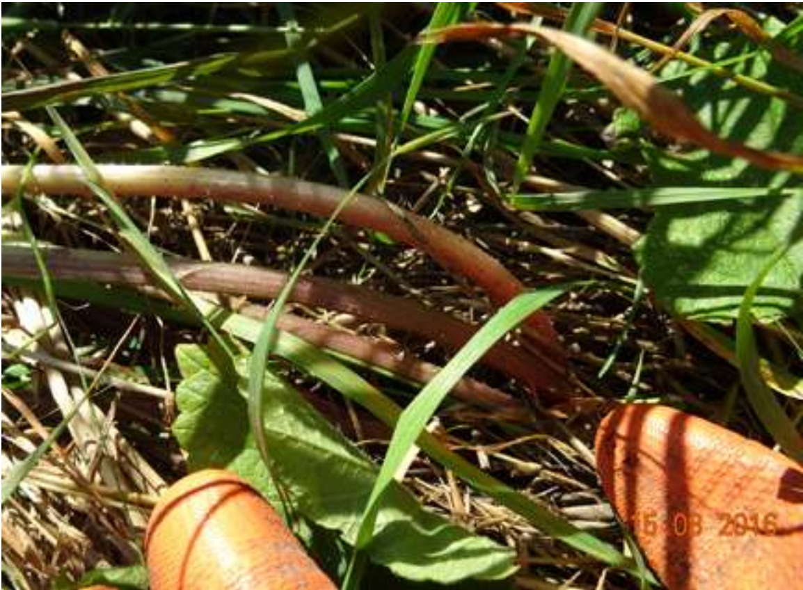
Photographer Astrid Wevers-grims is wearing gloves as she works to get close-up shots of bent nettles in Circle #1.

When this kind of bending is documented in thick-stemmed plants within hours of a circle forming (without concurrent breakage), the stem bending is caused by the heat-producing energy component (microwave radiation) of the circle-creating energy complex ( http://www.bltresearch.com/published/physics.html ) instantly heating up the plants' internal moisture to steam--thus softening both the stems' internal and external fibers so the plants can be flattened without breakage of the normally rigid stems.