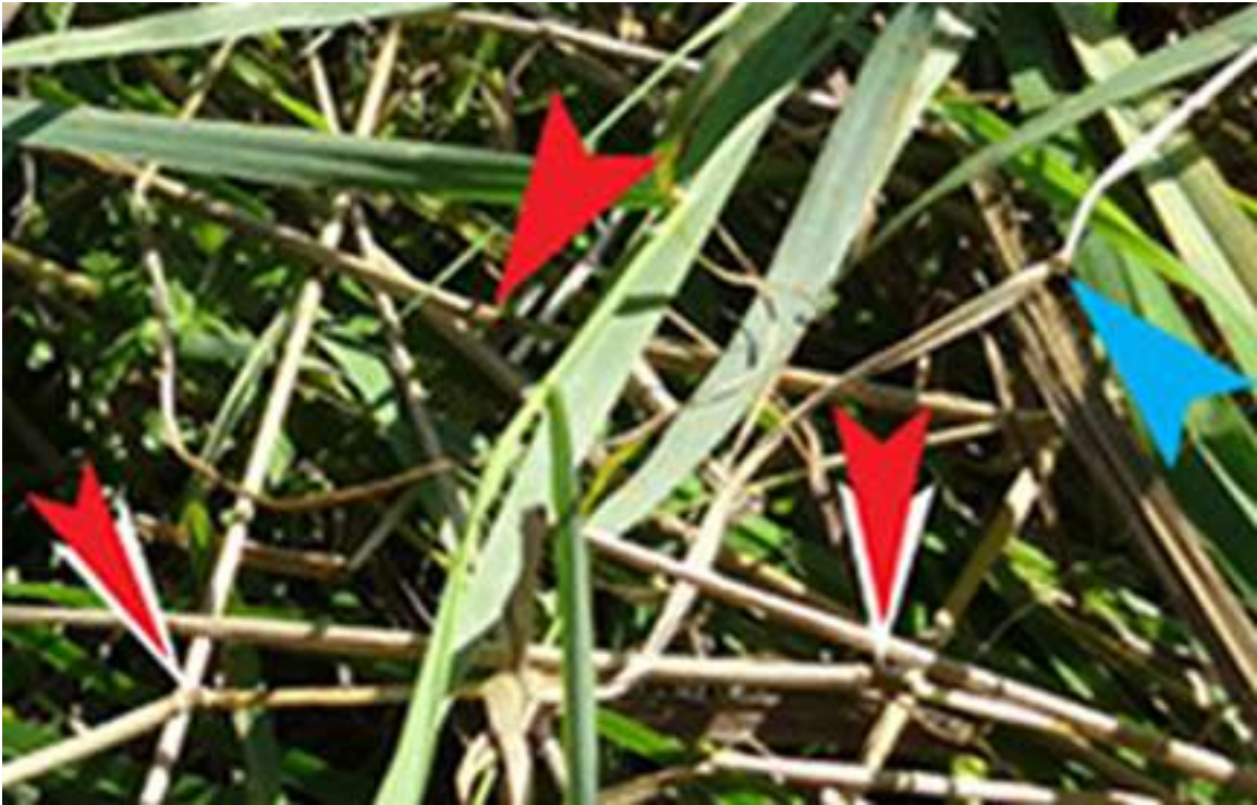
Grains mixed in with wild grasses & nettles show nodes bent downward (white arrows), elongated nodes (red arrows) & expulsion cavities (blue arrows) throughout. (See: http://www.blresearch.com/plantab.php )

As Robbert walked closer to the edge of the road he saw 4 circles flattened in a line along the side of the slope, overgrown with wild grasses and nettles (which have very sharp spines that sting if touched). He walked carefully down to the circles to feel the energy (which he says was very “gentle”) and, when he got to the last circle, was “flabbergasted” as an “electric” discharge of some kind--a bright flash of light--occurred right between his feet. In spite of his sense that this discharge was electrical, he did not FEEL a shock of any kind.