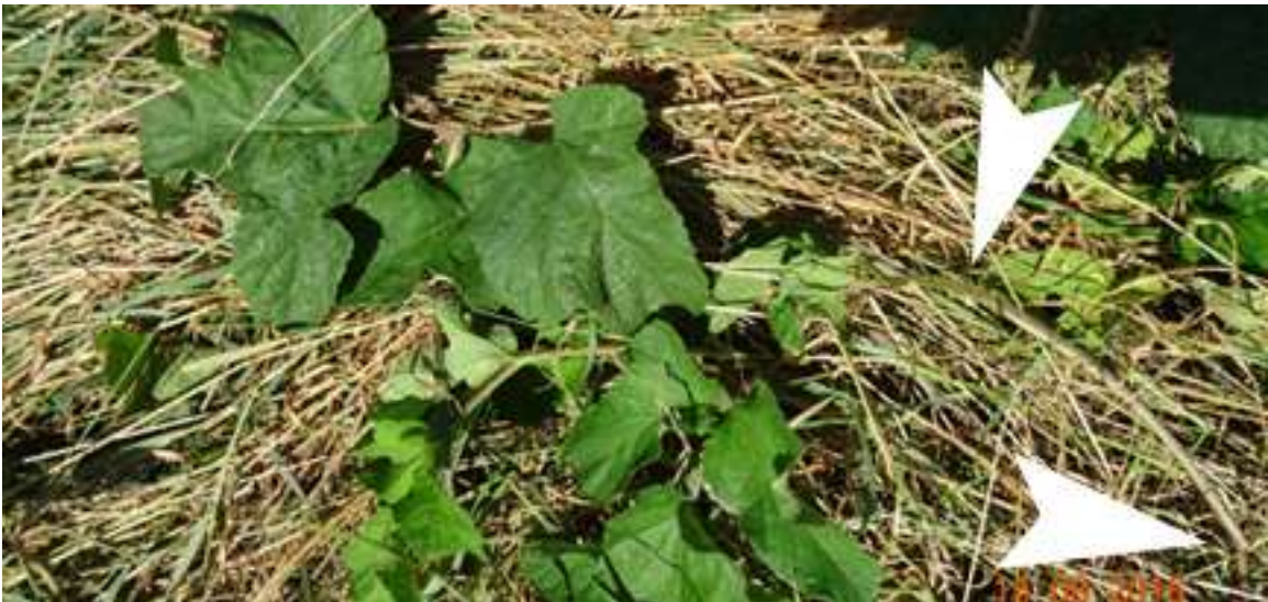
Circle #3 included swirled, thick-stemmed plants along with grasses.