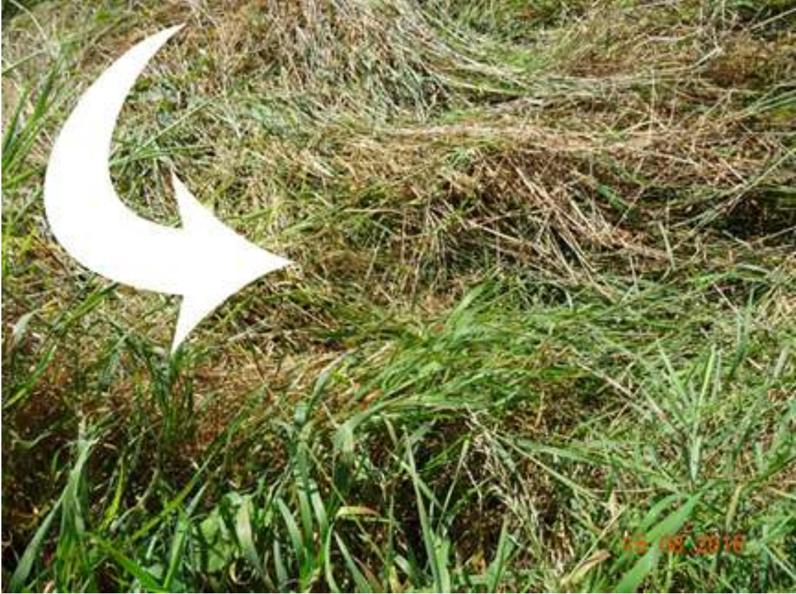
Since several of the documented plant abnormalities found in genuine crop circles are known to be caused by heat, did the “light-beams” dry out the grasses in Circle #2?