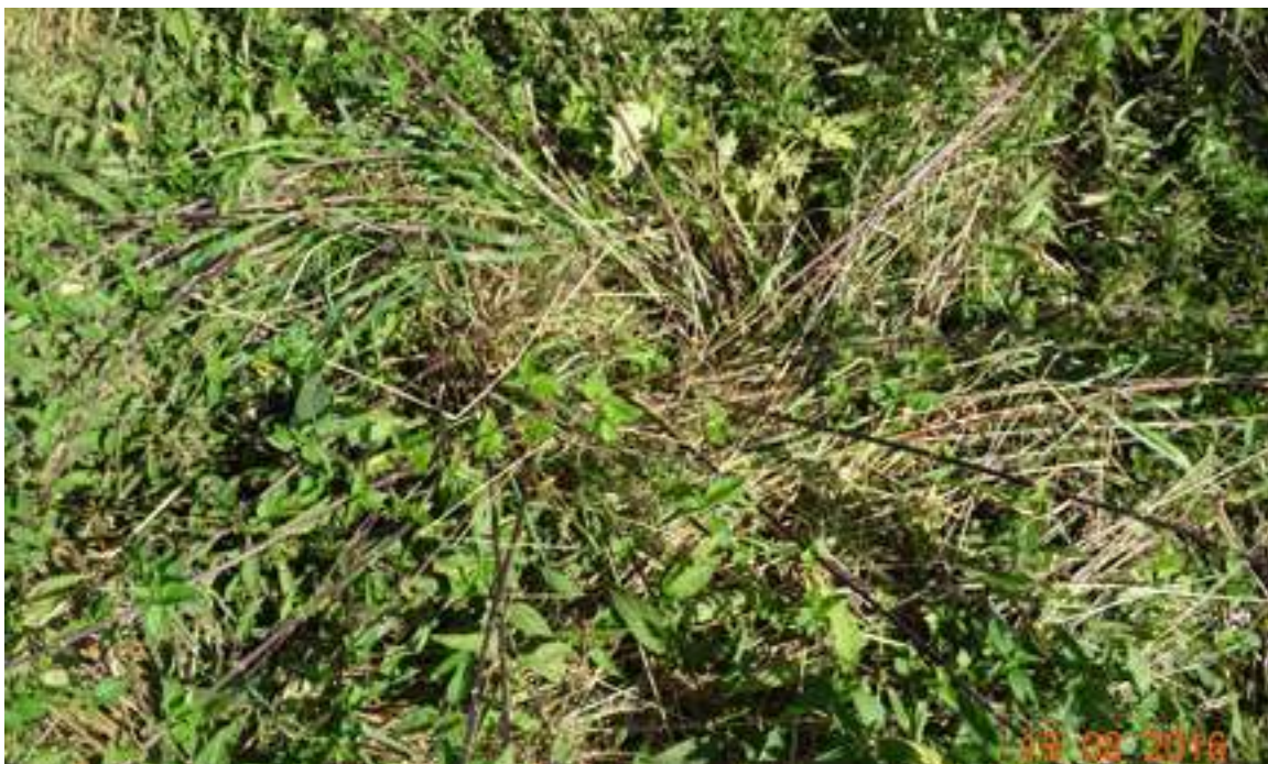
Circle #1 formed around a clump of thick-stemmed nettles, which were splayed radially outward into other wild plants & grasses.

Robbert had to walk carefully around this circle because it had formed around thick-stemmed nettles which have sharp barbs along their stems which are painful if touched (notice Astrid is wearing gloves in close-up photos she took the next morning).