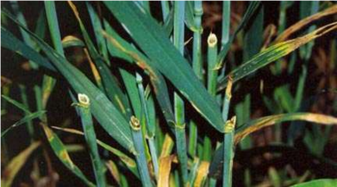
45 degree "cut" marks found on multiple occasions in crop formations in several countries is a feature not yet explained.