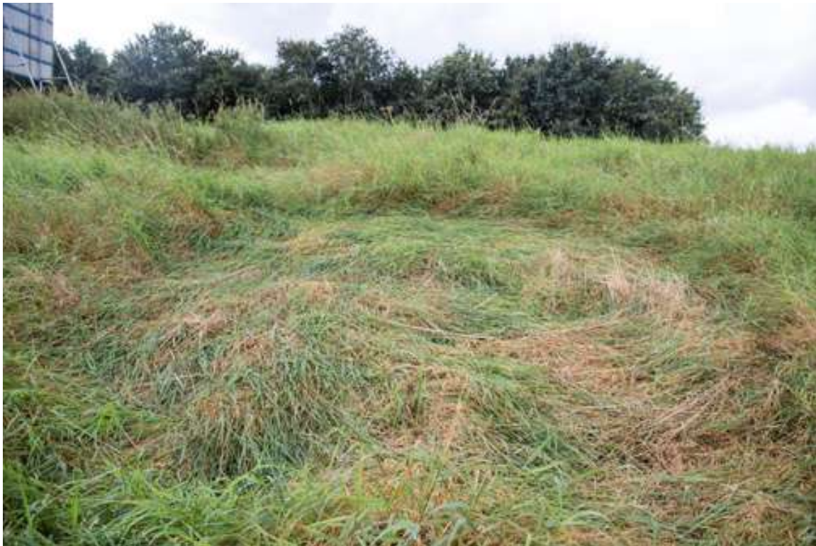
Circle #2, showing generally "fluffy" lay & marked browning of grasses, compared to other circles.

The second circle formed primarily in grasses and it appears that the heat from the "laser-like" light-beams Robbert observed shooting down from the light-balls to the roadside caused considerable drying out and browning of the grass.