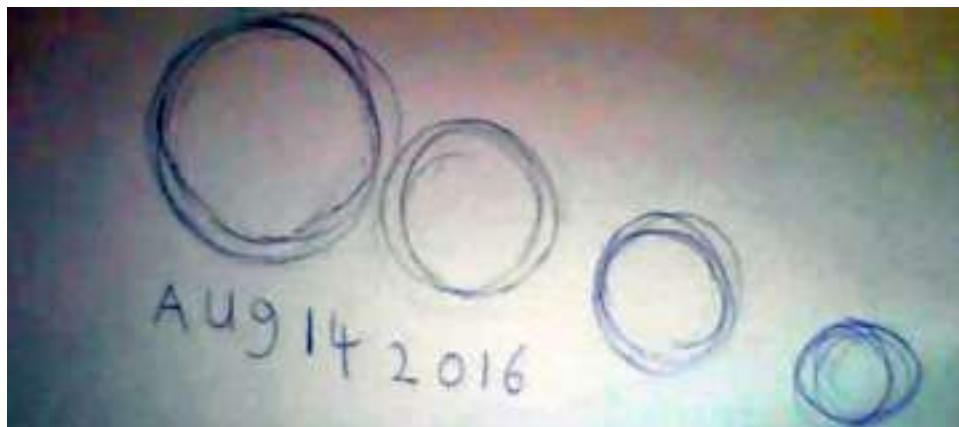
Robbert's drawing of relative sizes & placement of 4 circles created by 4 different-sized BOLs & "laser-like" light beams. (Drone could not be used due to proximity of circles to airport runway.)

At the end of the bridge near the Bosschenhoofd airport and the "Eye" design in planted flowers his motorbike suddenly stopped by itself & he couldn't re-start it. He had began pushing the bike when he saw a big flash of light and 4 light-balls (1 big & 3 smaller ones) suddenly appear, followed by "laser-like light beams" shooting down from the BOLs to the sloping side of the road on his right. He also heard an "electrostatic" type of noise as these light beams hit the ground. Then the light-balls, one by one, just went out & disappeared.