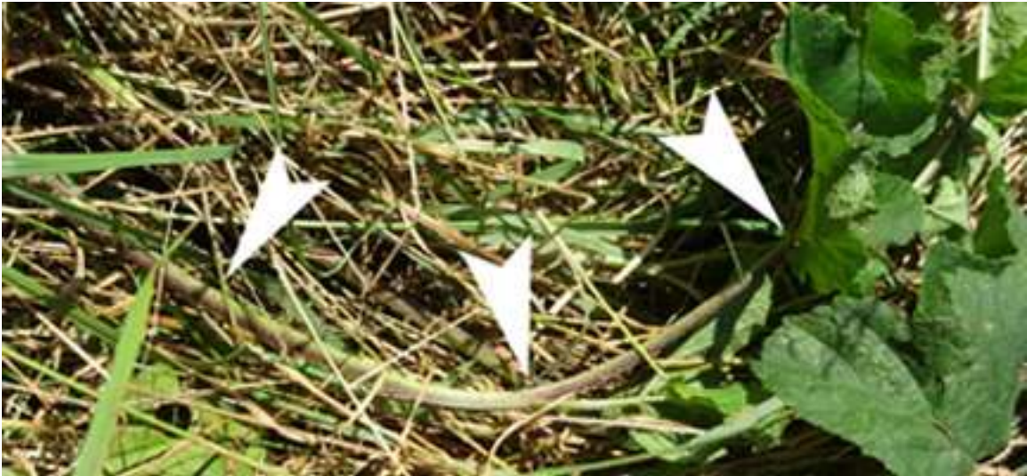
Thick stems of various plants were curved along their entire lengths, mixed in among the other wild grasses & plants.