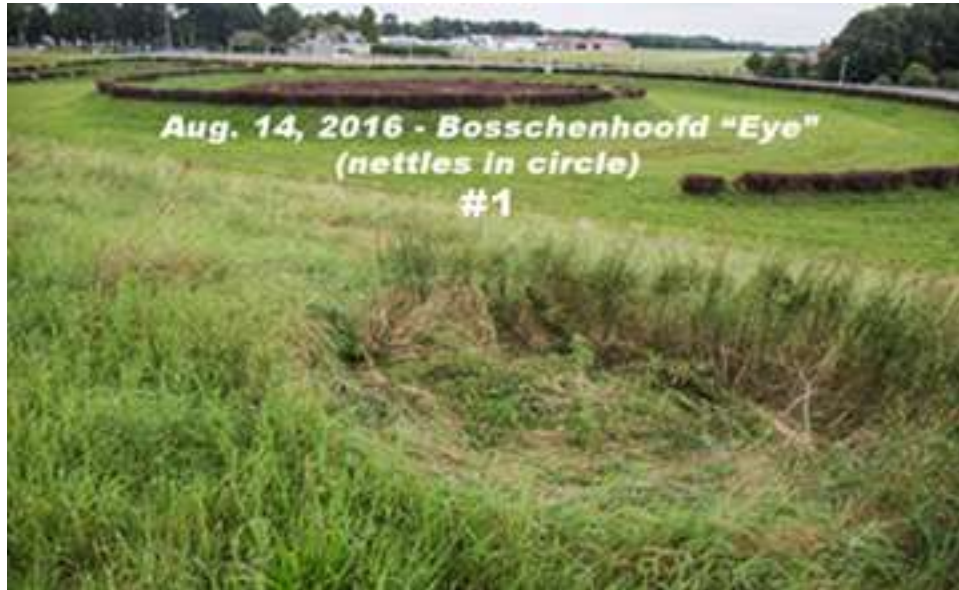
Circle #1 (closest to road) with Bosschenhoofd "Eye" & small local airstrip in background.