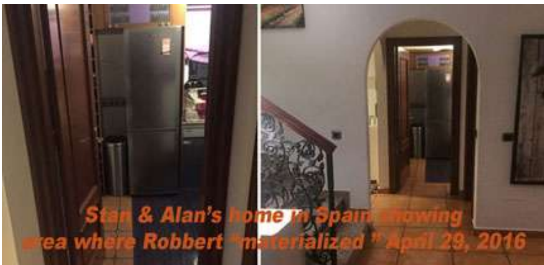
Two views of the area where Robbert appeared taken at my request, so people could see the area as it normally is.