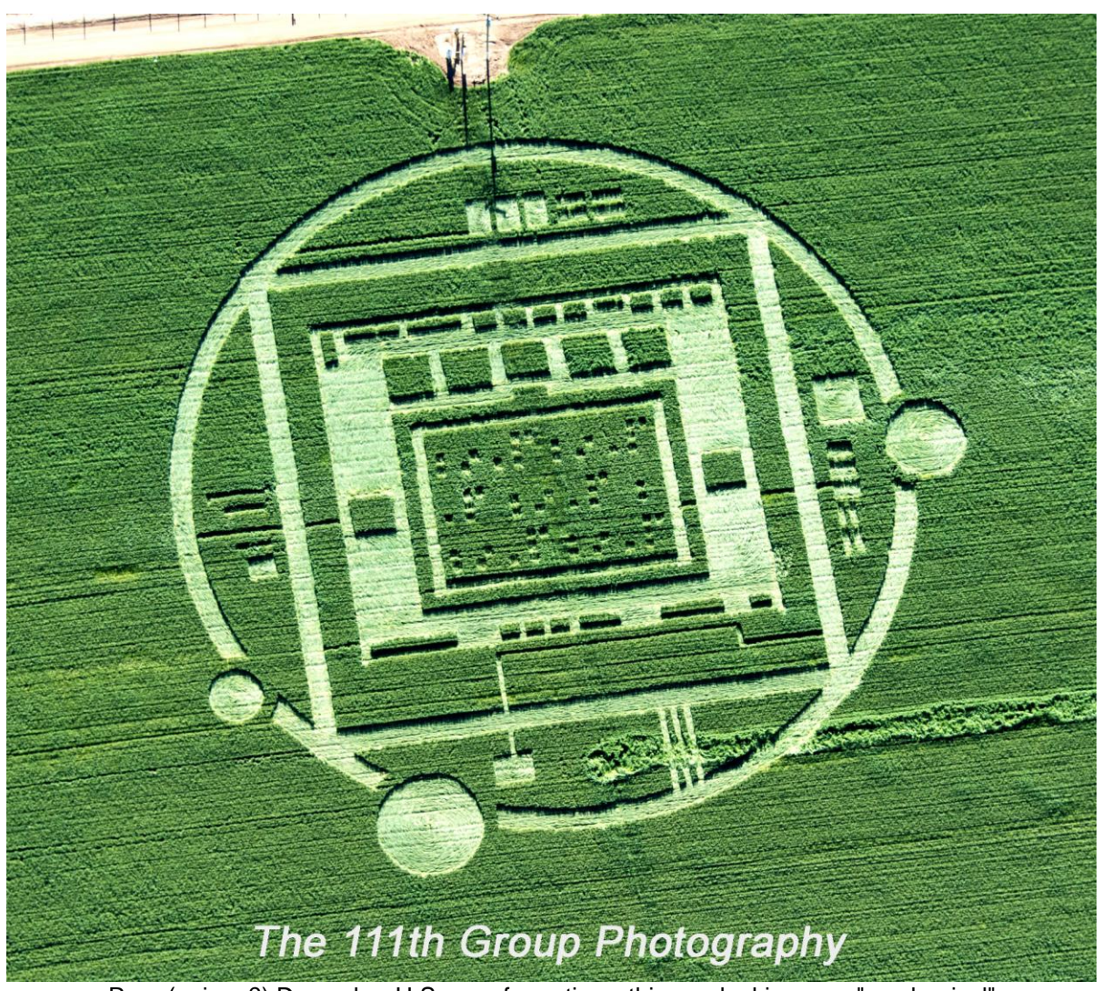
Rare (unique?) December U.S. crop formation—this one looking very "mechanical" (not genuine) to most experienced circle researchers.

A reporter from The Monterey Herald called the BLT Research Team on Dec. 30th, saying that a crop circle had been found earlier that morning about 6 miles south of Salinas, CA—and could I tell him whether this formation was "real" or man-made?