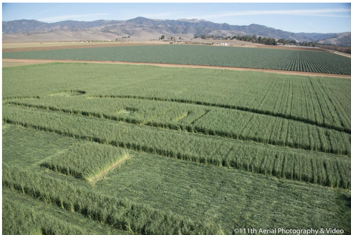
Very mechanical-looking "lay" of the flattened plants throughout formation.