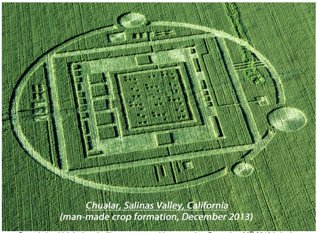
Crop circle which looks a lot like a computer chip reported on December 30<sup>th</sup> 2013 in barley field in Salinas Valley, CA.