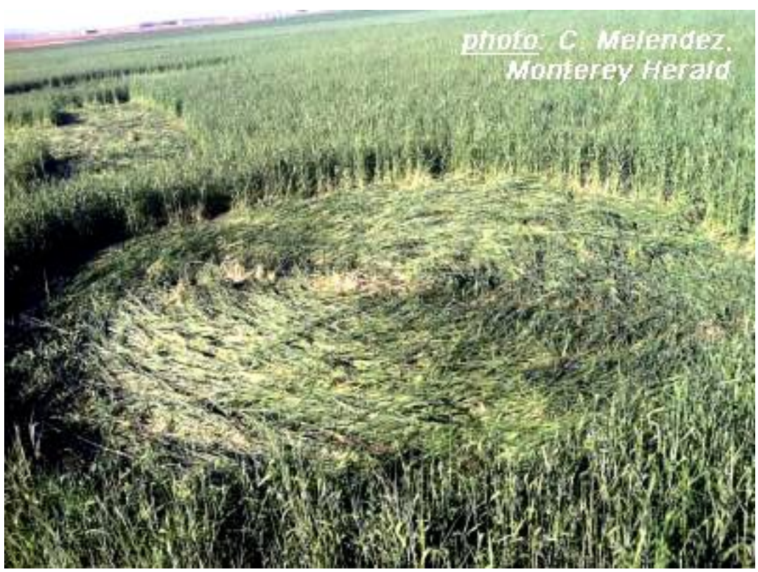
The only ground shot we've seen, of one of the circles in the Chualar formation, showing a very "rough" lay of the barley plants.